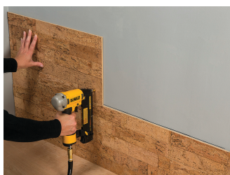
Nailing panel to surface