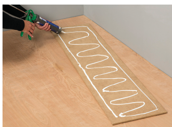
Apply adhesive to panel

Before installation, make sure that the surface is clean, flat and dry. If you are installing over a sheetrock wall that is painted a color, we recommend you paint the wall a similar color as the planking to be installed so the wall color will not show through any possible seams between the panels.